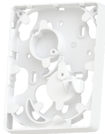
LARGE VERSION 15 x 88 x 115 mm