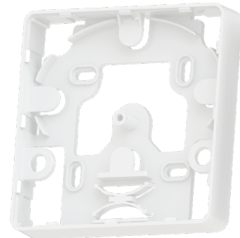
STANDARD VERSION 15 x 88 x 88 mm